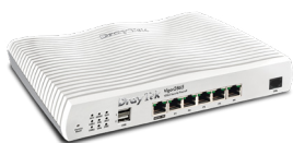
Vigor 2865 Firewall

Driven by online platforms like Deliveroo, the home delivery food market is growing fast, leaving restaurant brands struggling to keep up with demand. That's where Growth Kitchen comes in. They repurpose industrial units by installing around 10 individual professional kitchens, which they license to brands wanting delivery-only kitchens within their wider estate. Growth Kitchen then manages operations and sales within those sites.