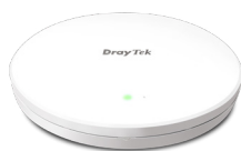
Vigor 960C Wi-Fi Access Point